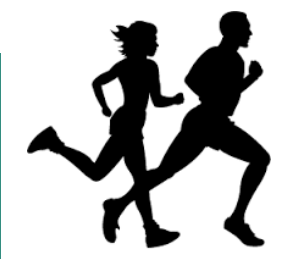
The MHOA Annual Conference will be held October 26-28th, 2016

The Conference committee is planning to hold the MHOA 5k run and a tour of the Cape Cod Beer Company!